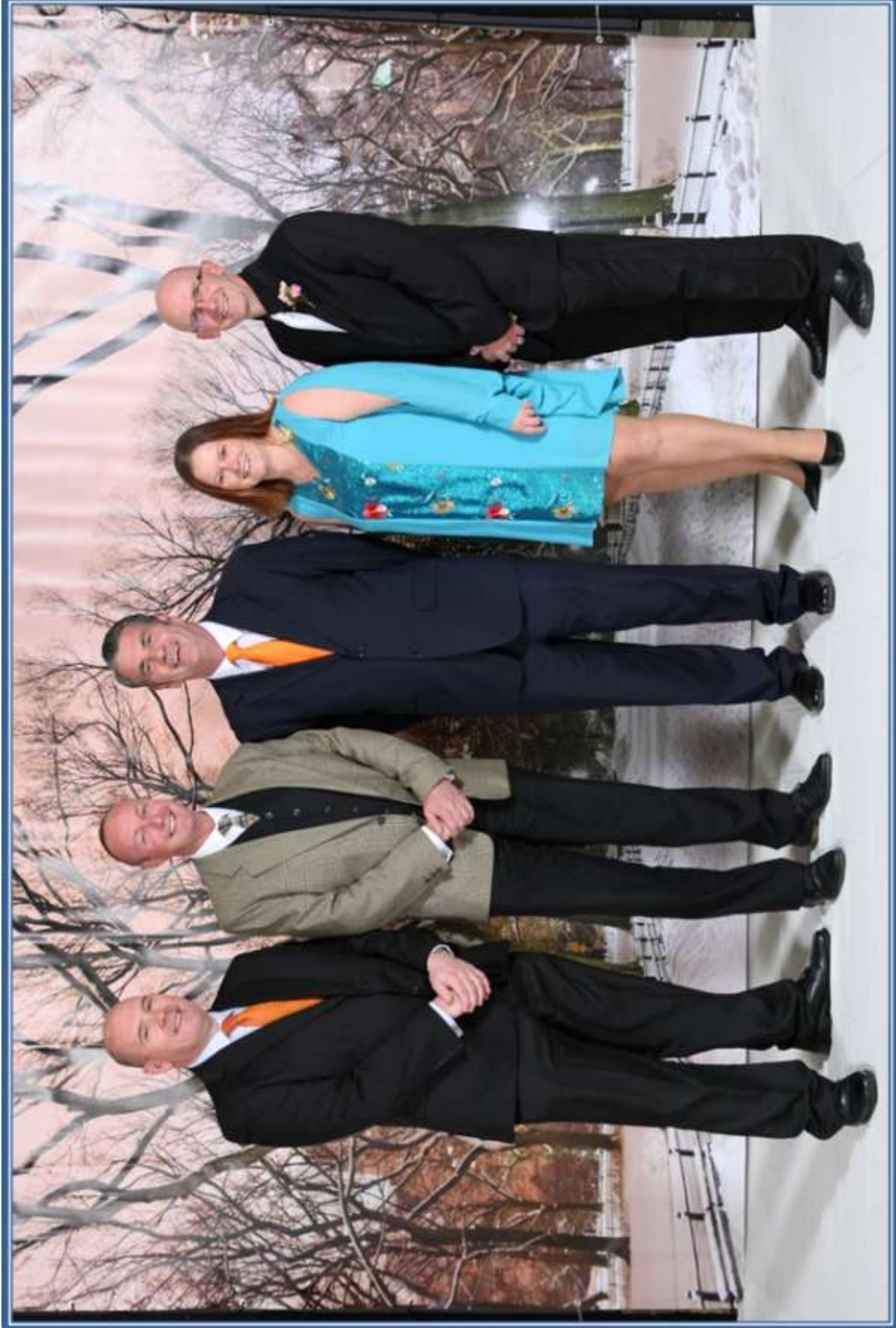
Senior Leadership Team 2022