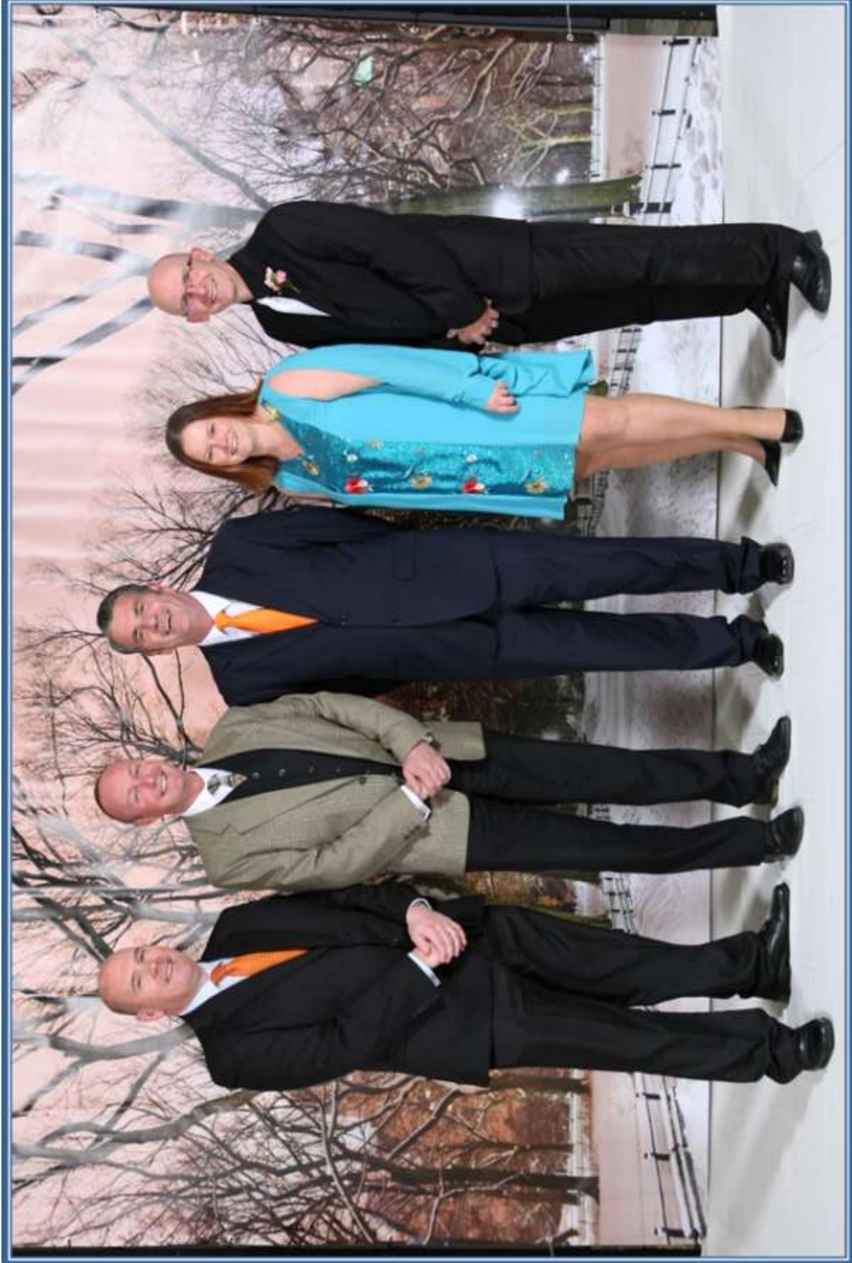
Senior Leadership Team 2021