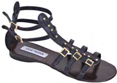
Non Roman Sandals