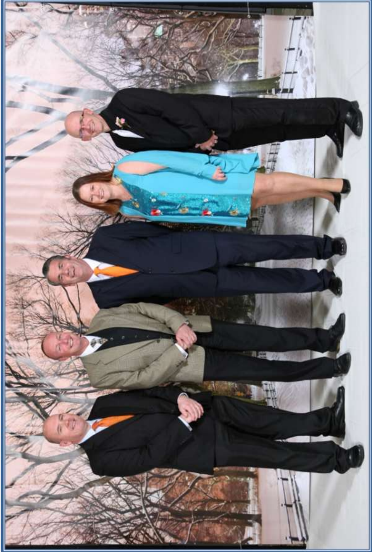
Senior Leadership Team 2020