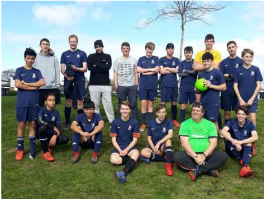
Te Awamutu Senior Boys Football 2nd XI